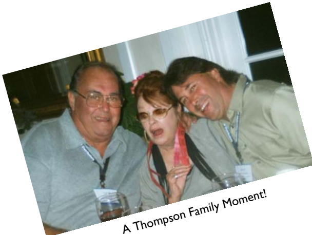
A Thompson Family Moment!